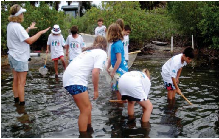
Eco-Explorers pull seine nets in the Indian River Lagoon in search of fish, crabs, and other marinelife.

This summer, the BIC was abuzz with 40 "Eco-Explorers" from Georgia, Tennessee and Florida. Each week during July, 10 Eco-Explorers, ranging from grades 3 to 8, learned all about sea turtles, beach and dune ecosystems, the Indian River Lagoon and the native plants and animals that utilize the barrier island and surrounding waters.